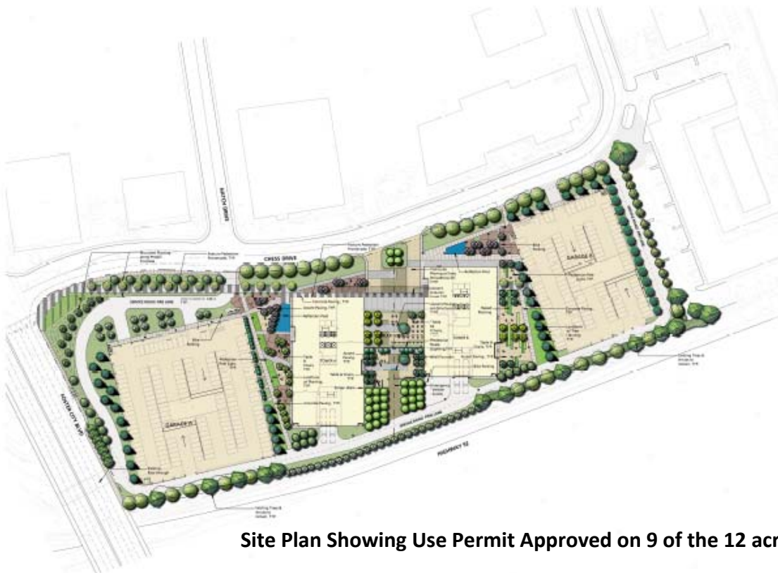
Site Plan Showing Use Permit Approved on 9 of the 12 acres