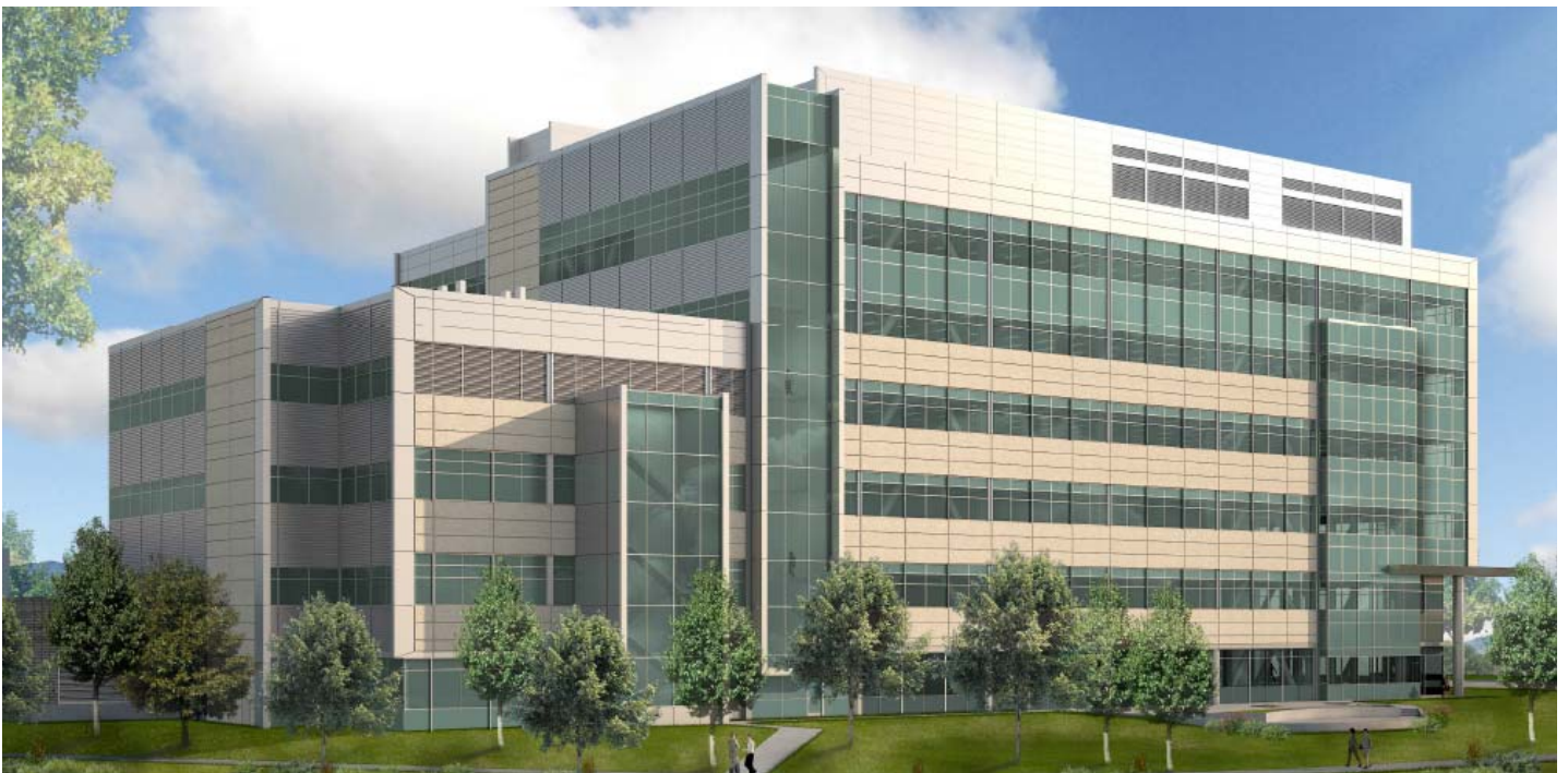
6-Story, 191,235 sq. ft. Lab Building with 3-Story, 23,914 sq. ft. Pilot Lab