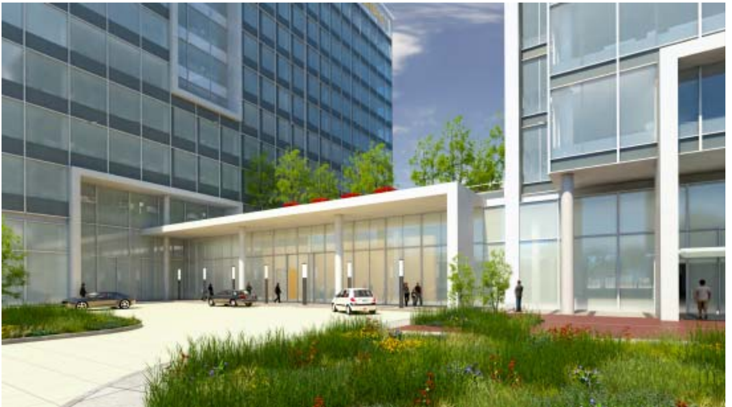
1-story connector building—29 feet between two office buildings