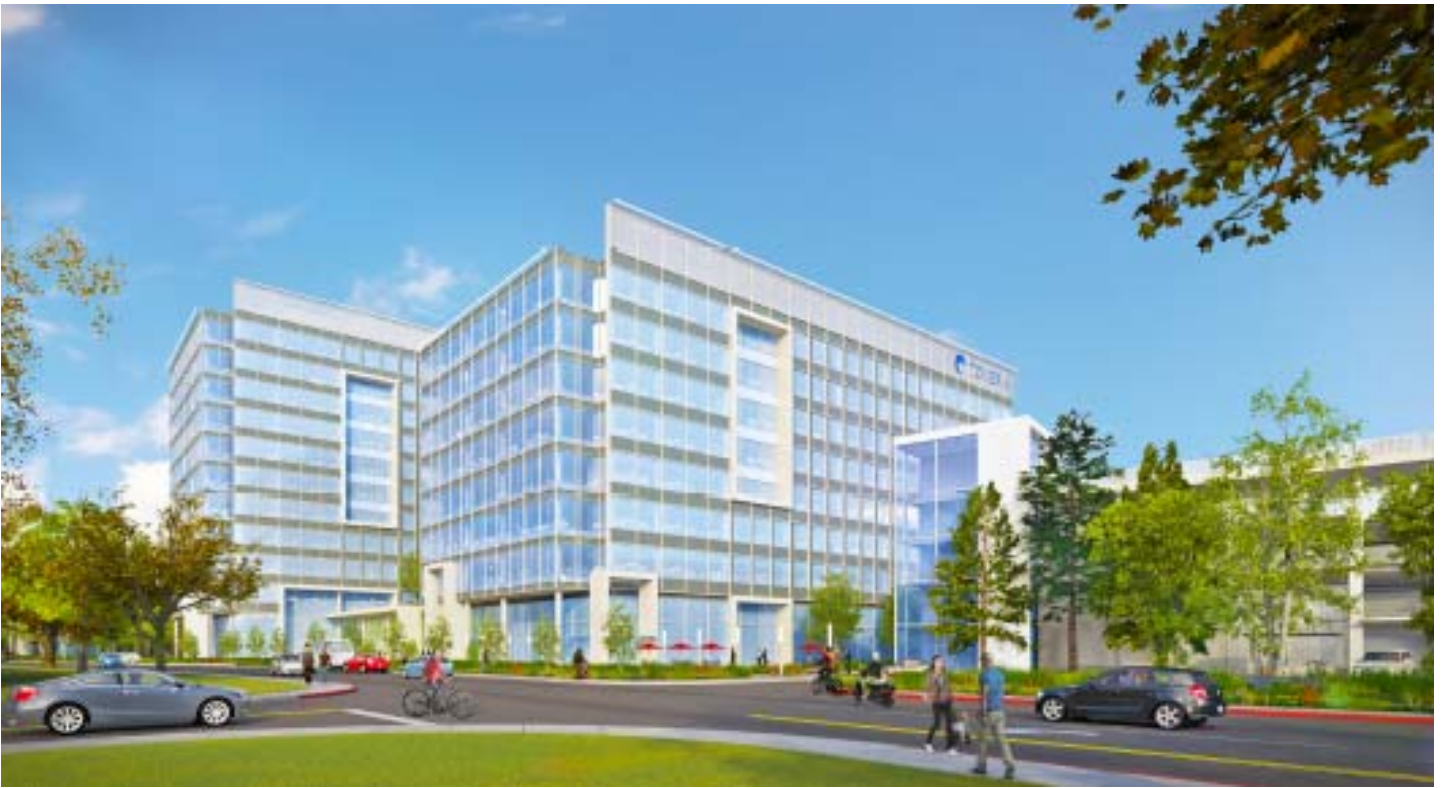
9-Story and 12-story 600,000 sq. ft. Office Buildings