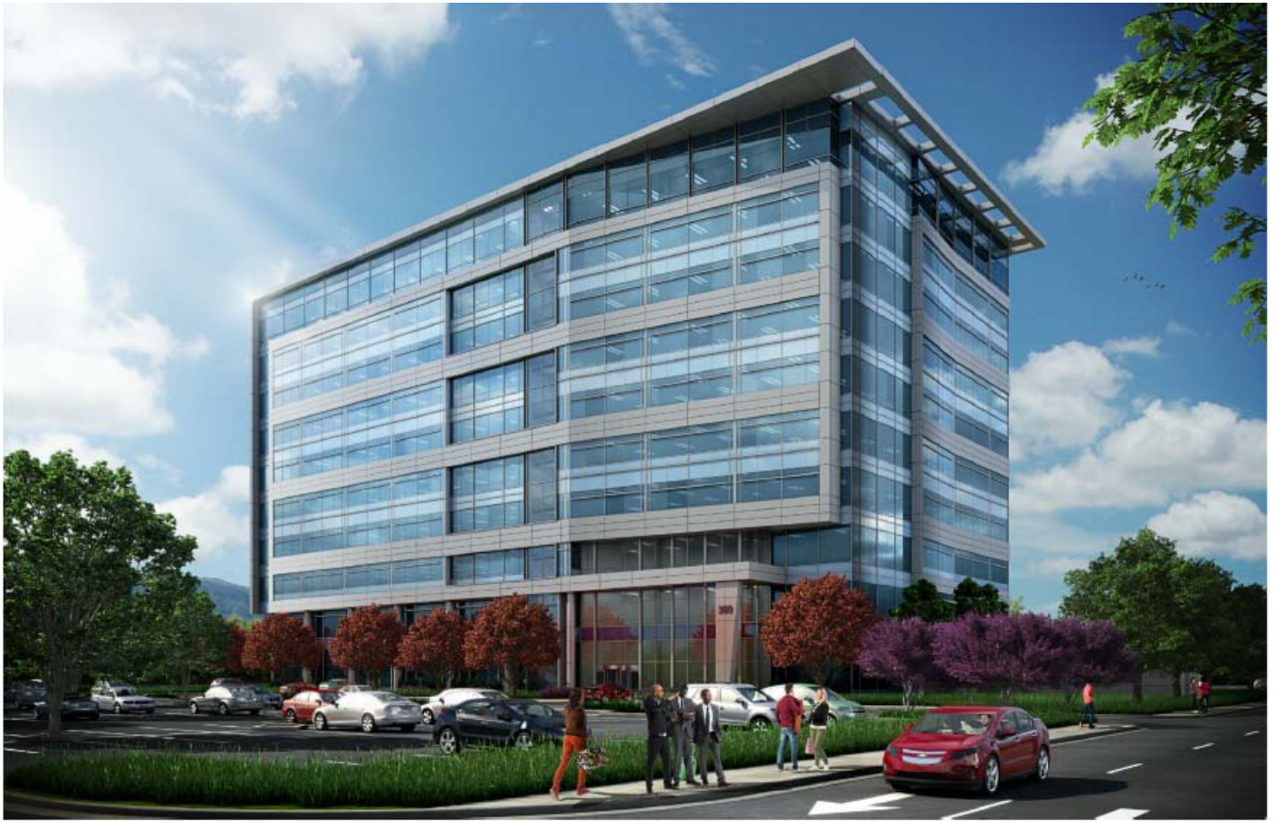
10 Story, 314,746 sq. ft. Office Building