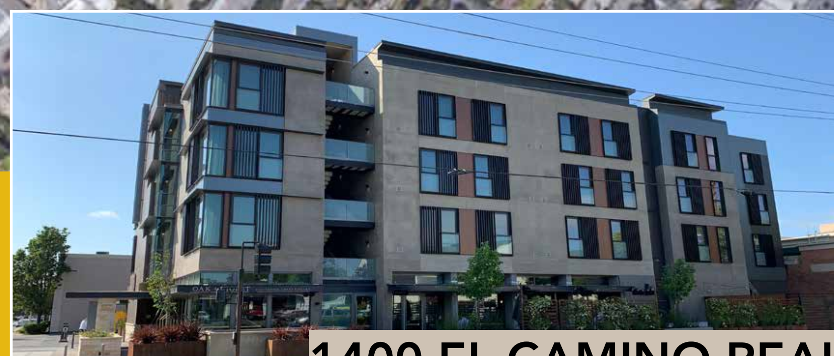
B 1400 EL CAMINO REAL "Park James Hotel" 61 Room Hotel / Restaurant Status: Complete