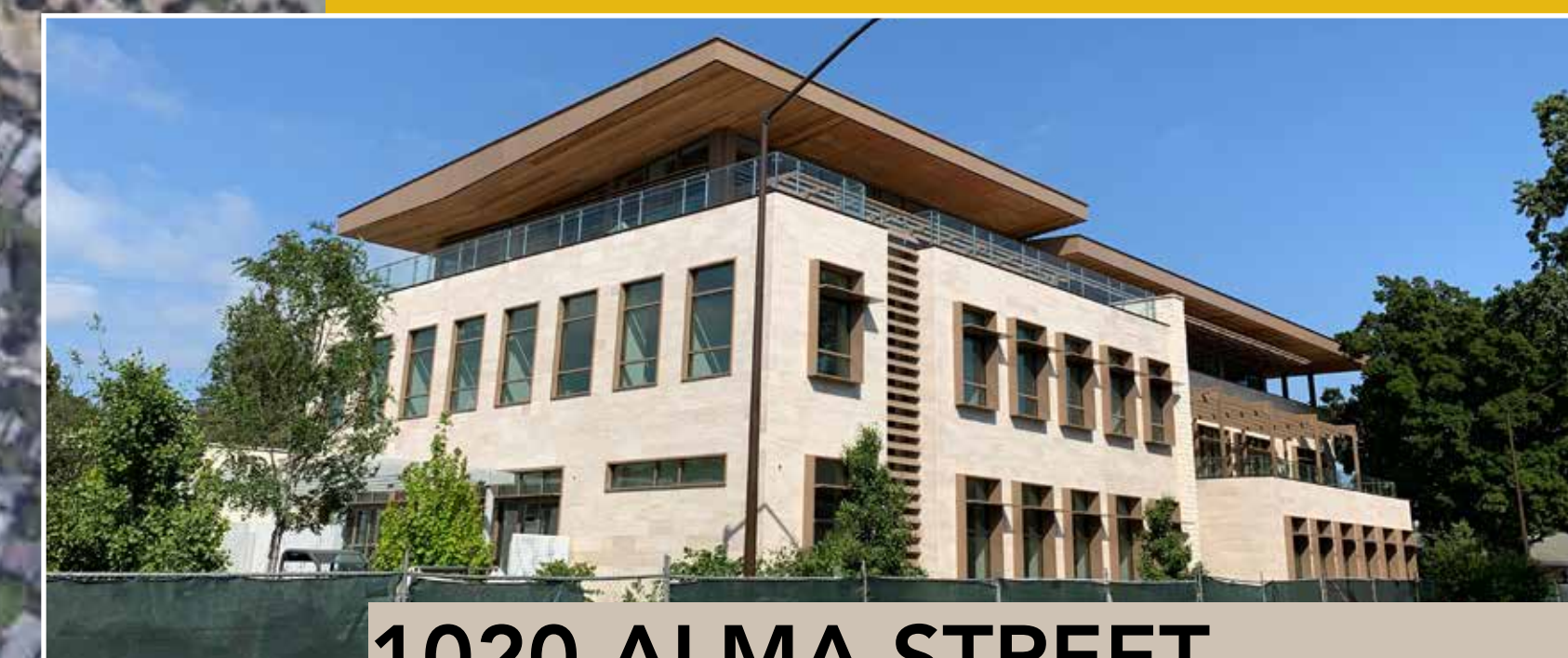
C 1020 ALMA STREET "Alma Station" 25,156 SF Office / 324 SF Cafe / Public Plaza Status: Nearing Completion