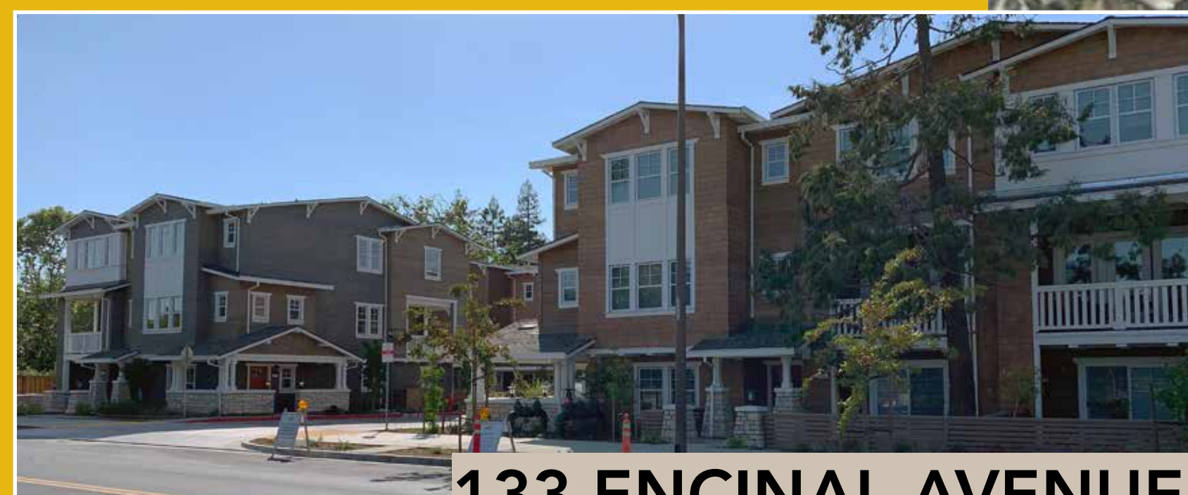
A 133 ENCINAL AVENUE "Marquis" 24 Townhouse-Style Units Status: Nearing Completion