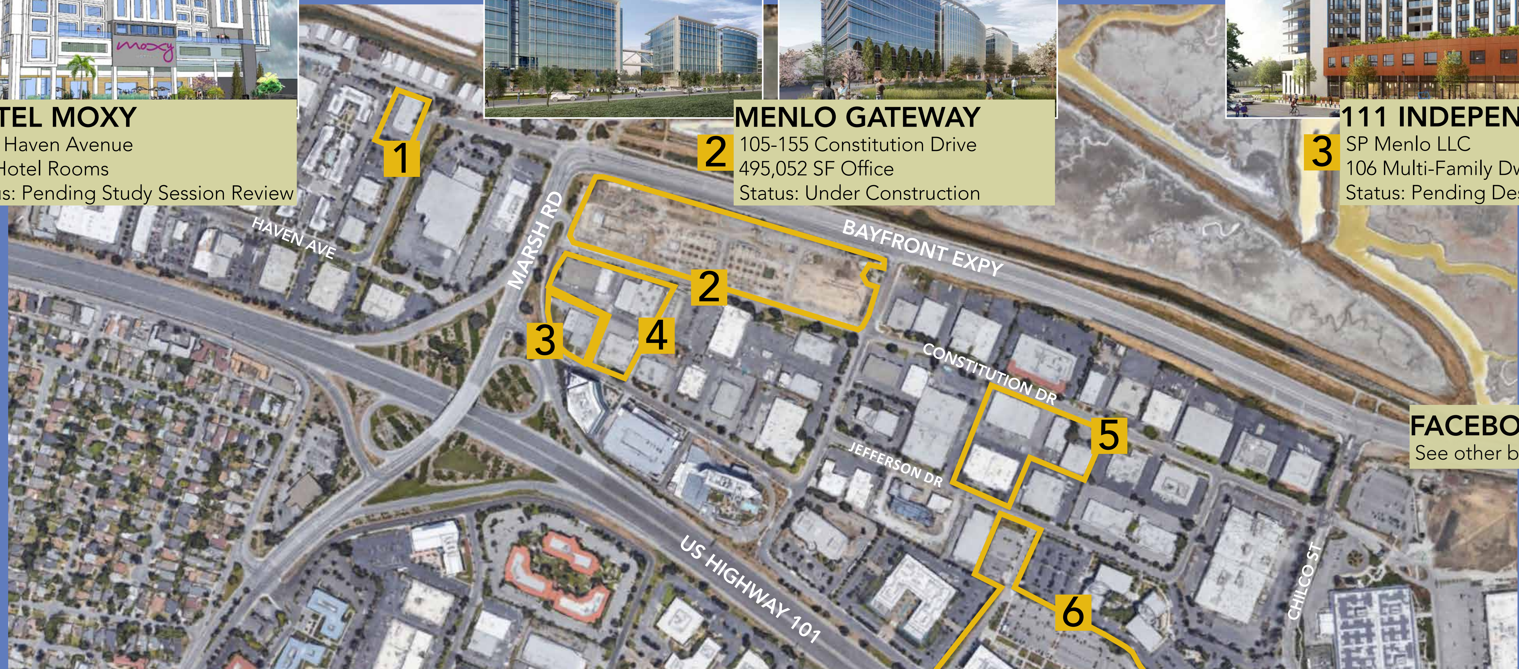
FACEBOOK PROJECTS See other boards for more detail