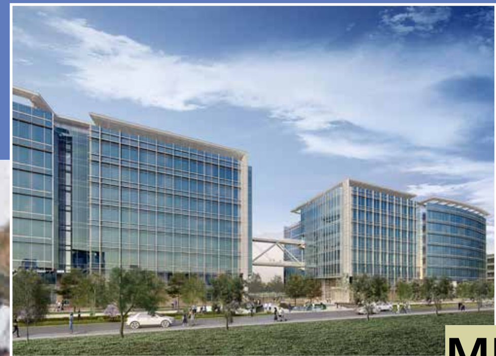
2 MENLO GATEWAY 105-155 Constitution Drive 495,052 SF Office Status: Under Construction