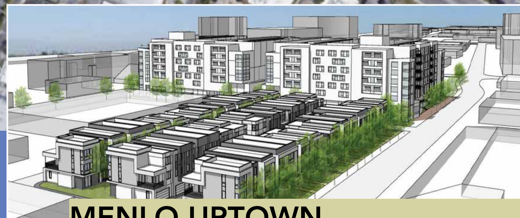
5 MENLO UPTOWN 141 Jefferson Drive, 180-186 Constitution Drive 483 Dwelling Units / 2,000 SF Commercial Status: Pending Study Session Review