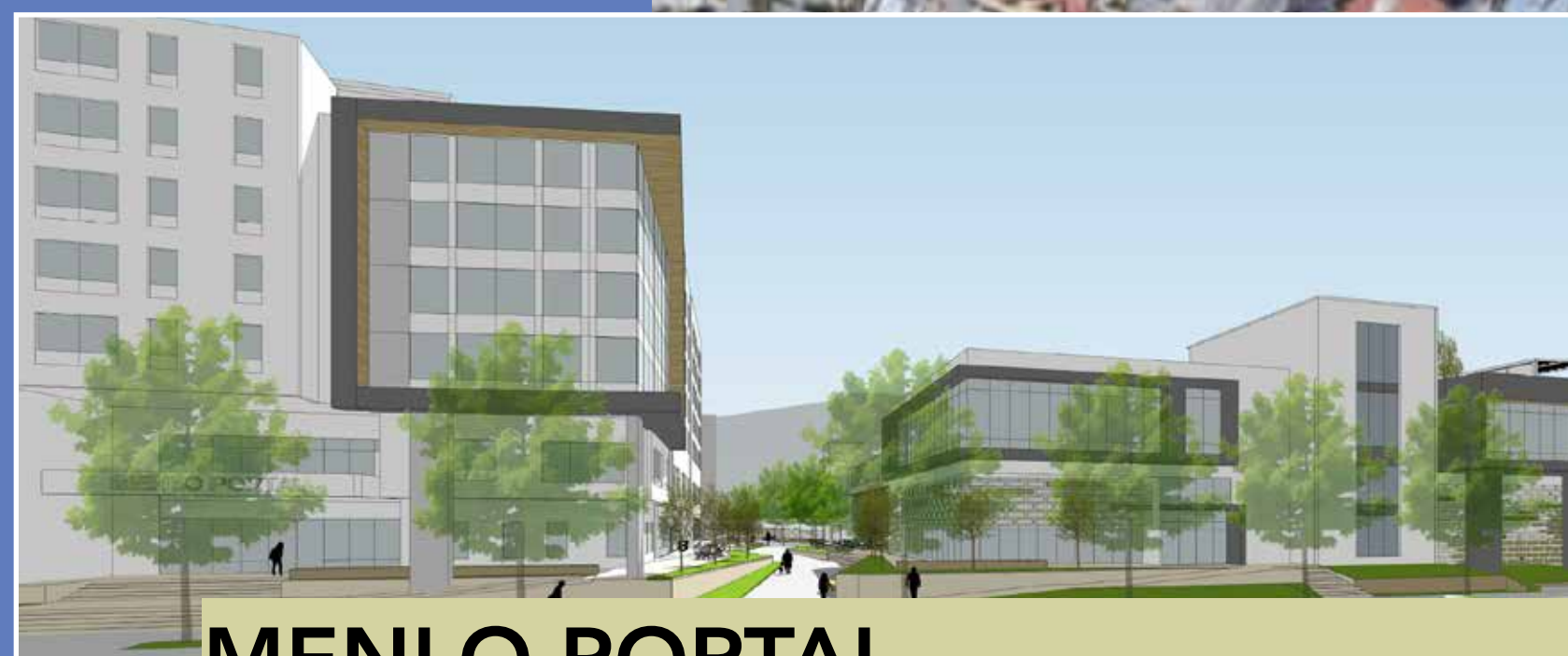
4 MENLO PORTAL 104-110 Constitution Dr, 115 Independence Dr 320 Dwelling Units / 34,700 SF Office / 1,600 SF Commercial Status: Pending Study Session Review