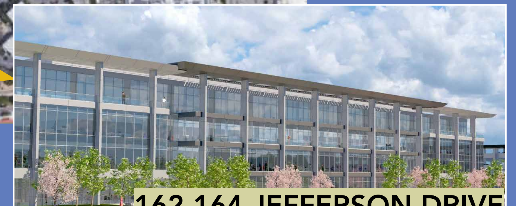
6 162-164 JEFFERSON DRIVE The Sobrato Organization 249,500 SF Office Status: Pending Design Review