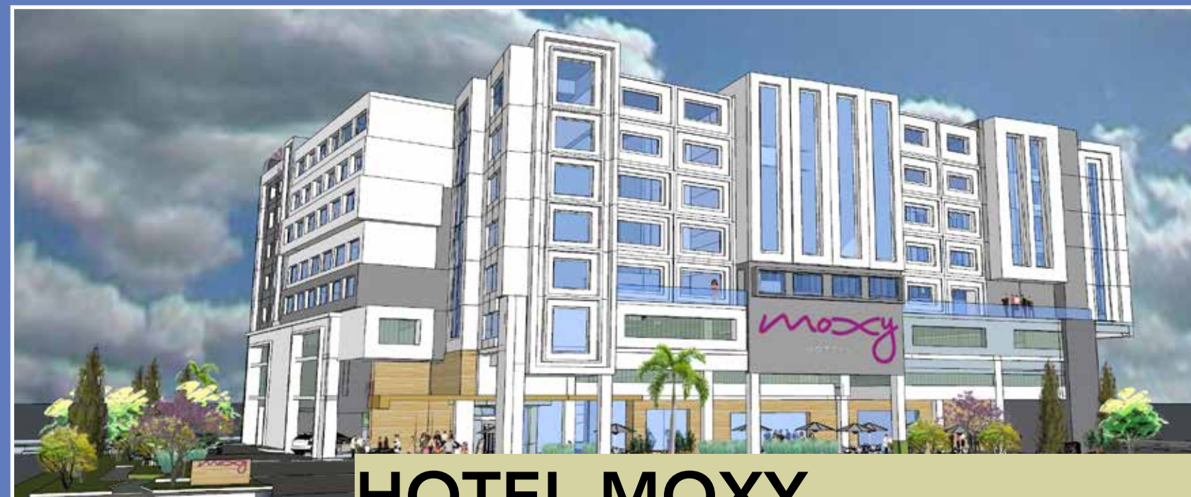
1 HOTEL MOXY 3723 Haven Avenue 167 Hotel Rooms Status: Pending Study Session Review