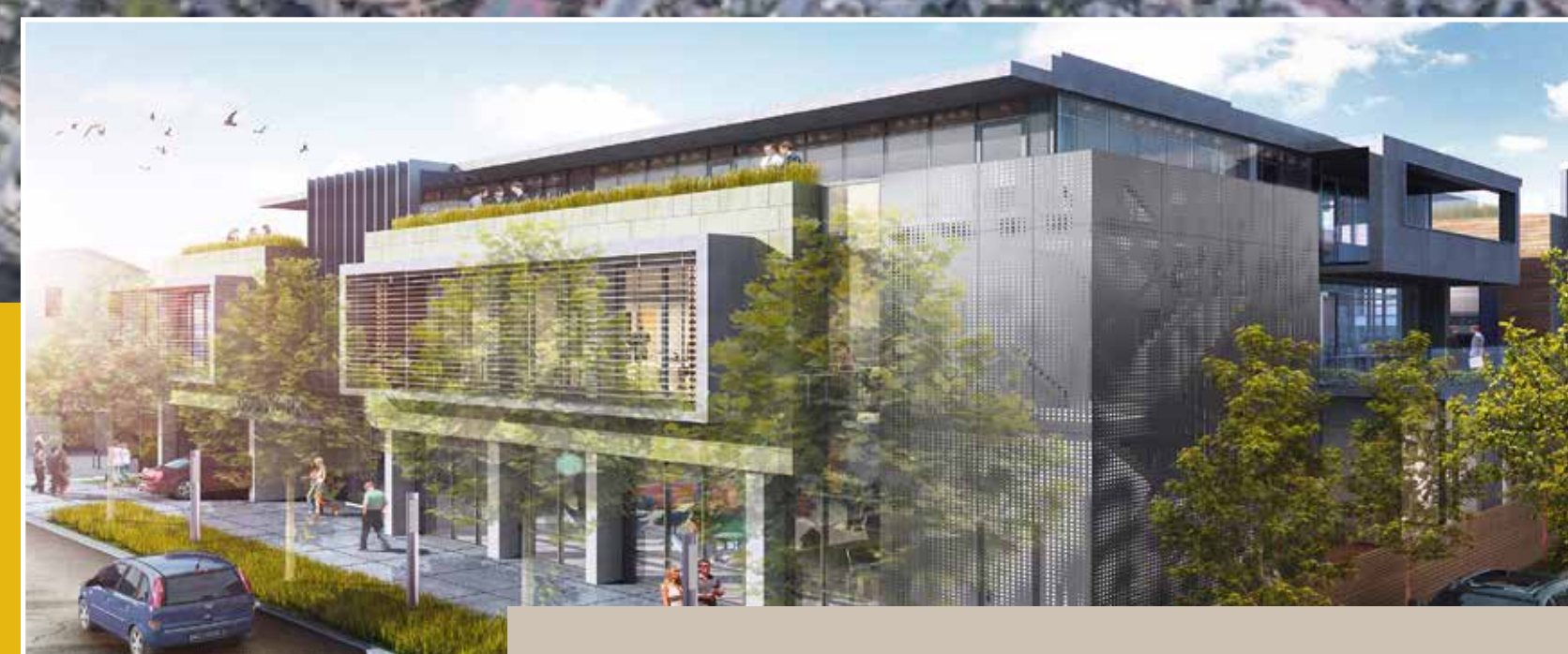
D 650 LIVE OAK AVENUE 17 Residential Units / 16,854 SF Office Status: Under Construction