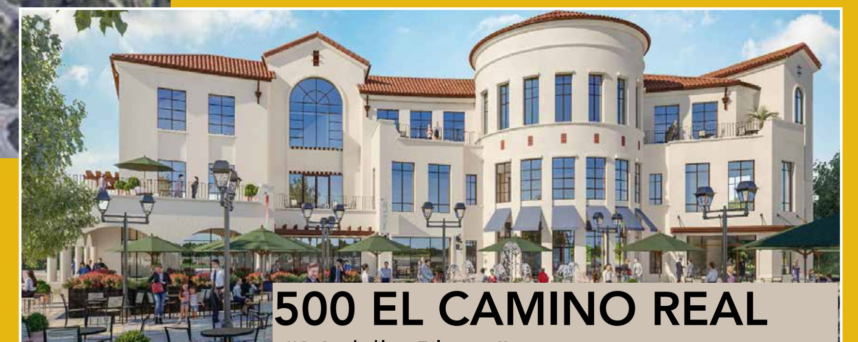
E 500 EL CAMINO REAL "Middle Plaza" 215 Apartments / 144,000 SF Office / 10,000 SF Retail / Public Plaza Status: Under Construction