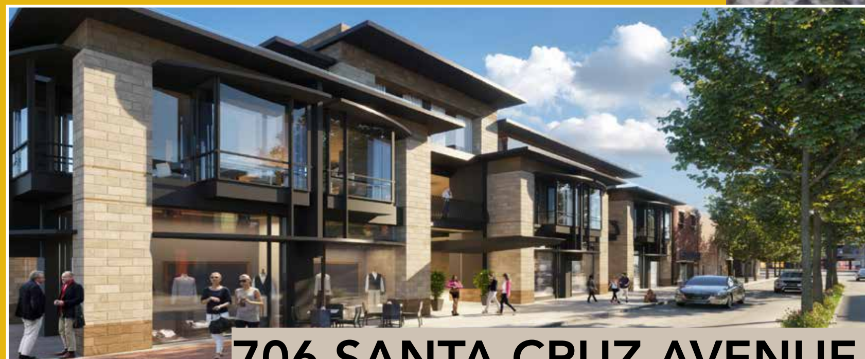
B 706 SANTA CRUZ AVENUE 4 Residential Units / 23,454 SF Office / 12,035 SF Retail Status: Pending Design Review