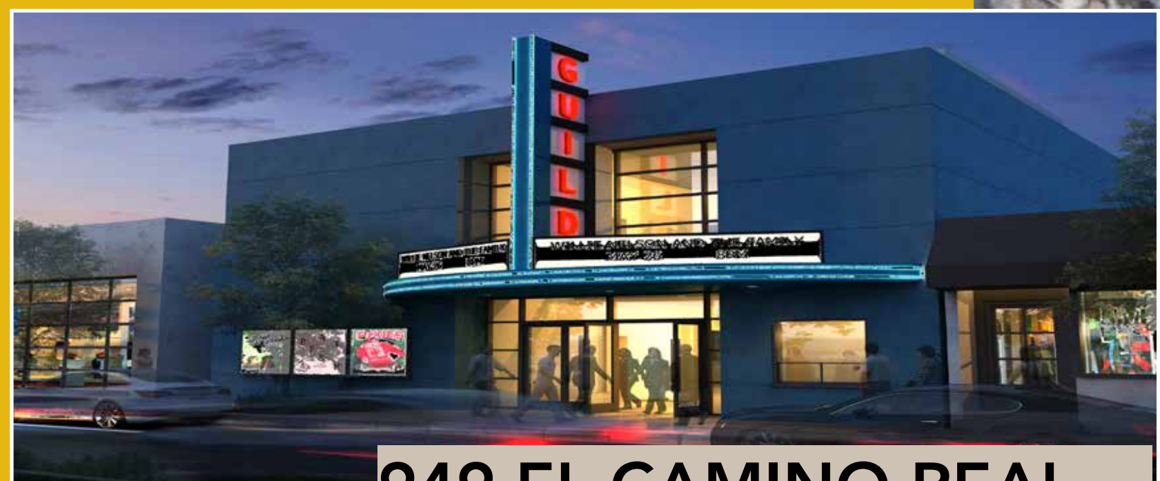
C 949 EL CAMINO REAL "The Guild Theatre" 10,854 SF Live Entertainment Venue Status: Approved