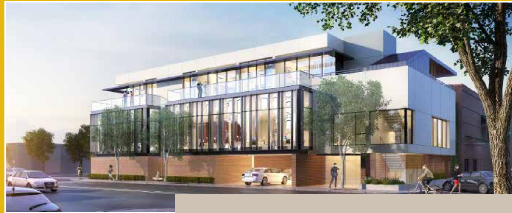
A 840 MENLO AVENUE 3 Residential Units / 6,610 SF Office Status: Approved