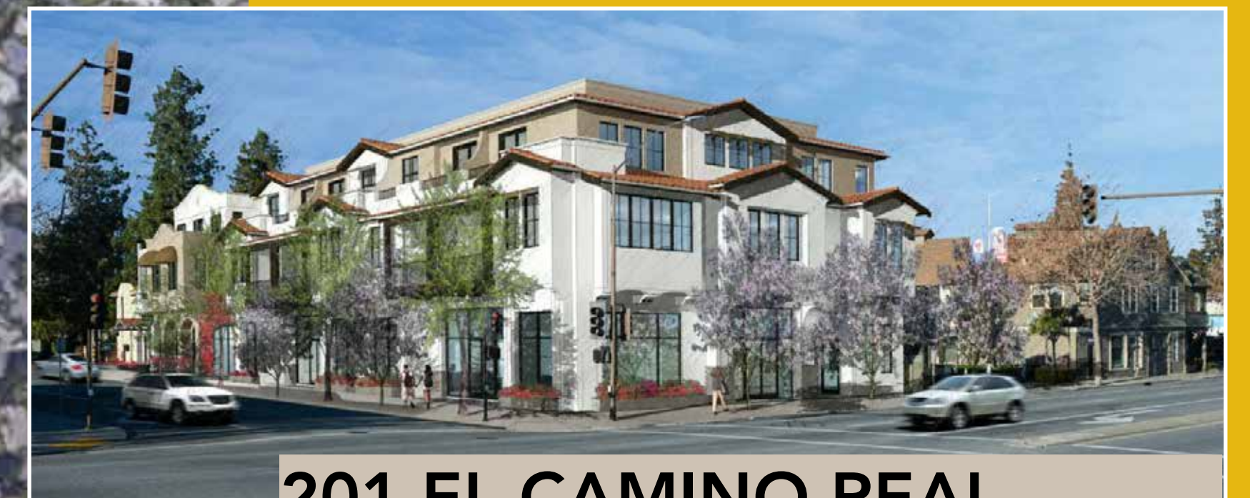
F 201 EL CAMINO REAL 14 Residential Units / 2,994 SF Med Office / 4,301 SF Restaurant & Retail Status: Pending Design Review