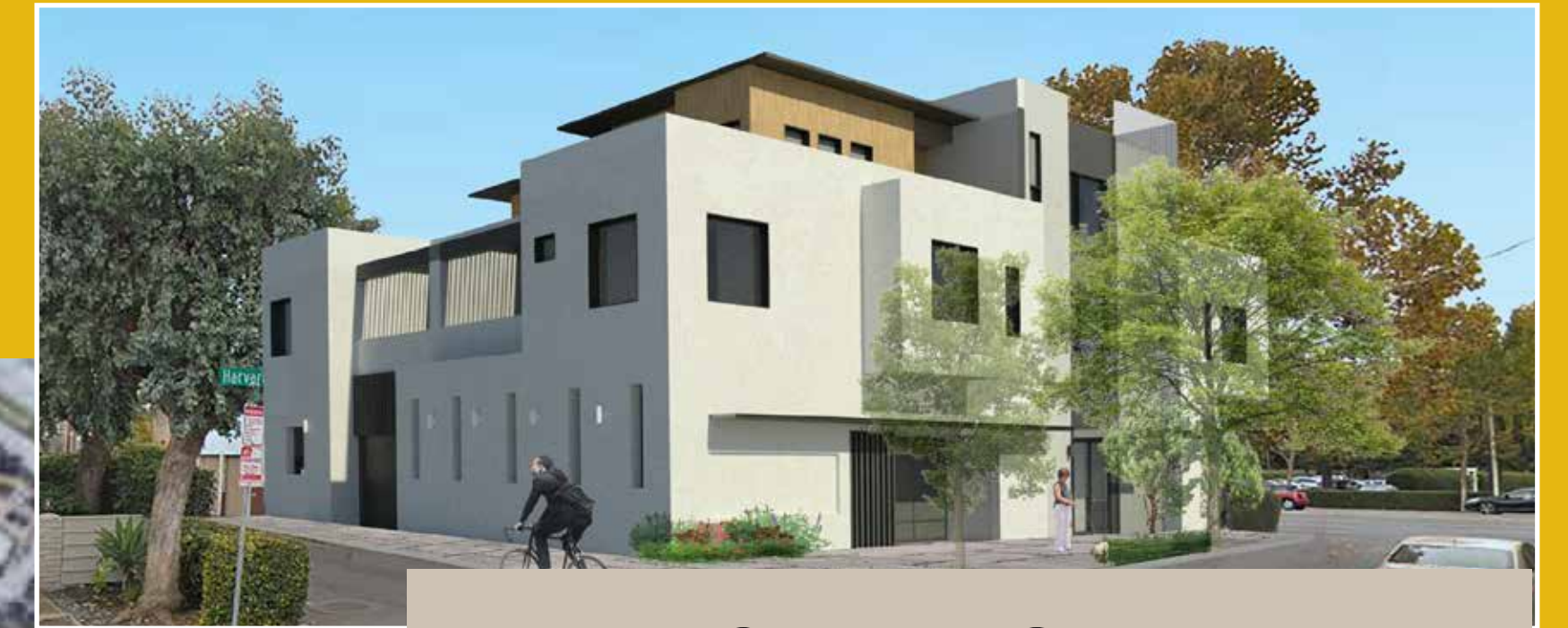
G 115 EL CAMINO REAL 4 Residential Units / 2,001 SF Commercial Status: Pending Design Review