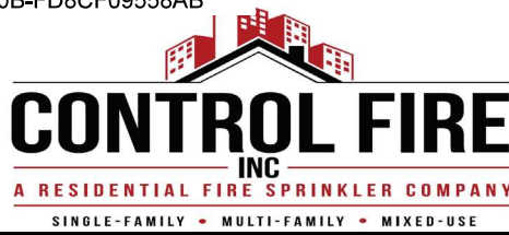
EXHIBIT A-1 50 WOODSIDE PLAZA, #214 REDWOOD CITY, CA 94061 650-268-9928 P | 650-649-1797 F www.controlfire.biz

DESIGN | INSTALLATION SERVICE | INSPECTION CONSULTING LICENSE C-16 #1015580