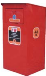
Sharps disposal container

If your health care provider does not offer collection, find a disposal bin at the following locations: