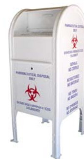
Pharmaceutical Drop-off container